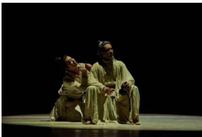
Figure 3. Zhao Wutu from the dance drama “The Orphan of Zhao”.

Zhao Wu’s tragic fate lies not only in the fact that he lost his biological parents, but also in the fact that he had to choose between his two fathers. His path to growth was full of confusion and struggle, and every choice was accompanied by pain and sacrifice. Through the character of Zhao Wu, the dance drama explores the moral and emotional conflicts that people face in the process of growing up, that is the hedge between justice and family affection. Every choice made by Zhao Wu is an exploration of self-cognition and identity, and a profound experience of good and evil, love and hate in human nature. His story allows the audience to see a child who constantly searches for himself and tries to understand the world in the twists and turns of fate. His image deeply touches people’s hearts and makes people think deeply. Zhao Wu’s dance movements and expressions vividly convey his inner contradictions and struggles, making this character full of vitality and appeal. Through Zhao Wu’s story, the dance drama “The Orphan of Zhao” shows the audience the complexity of human nature and the difficulty of moral choices, while also expressing the questioning of the meaning of life and a deep understanding of human nature. (See Figure 3 )