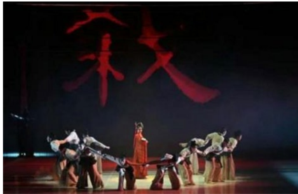
Figure 1. Dance drama “The Orphan of Zhao”.

The Orphan of Zhao is a dance drama launched by the Chinese Opera and Dance Theater, adapted from the Yuan miscellaneous drama of the same name. Tells the story of the Spring and Autumn period, the state of Jin noble Zhao was treacherous minister Tu An Jia framed and was destroyed, the only bone and blood was entrusted to the door guest Cheng Ying. In the crisis of killing, Cheng Ying in order to save the lives of the Zhao orphan and the city baby, sacrificed his own flesh and blood. From then on, Cheng Ying alone embarked on a long road of loyalty. (See Figure 1 )